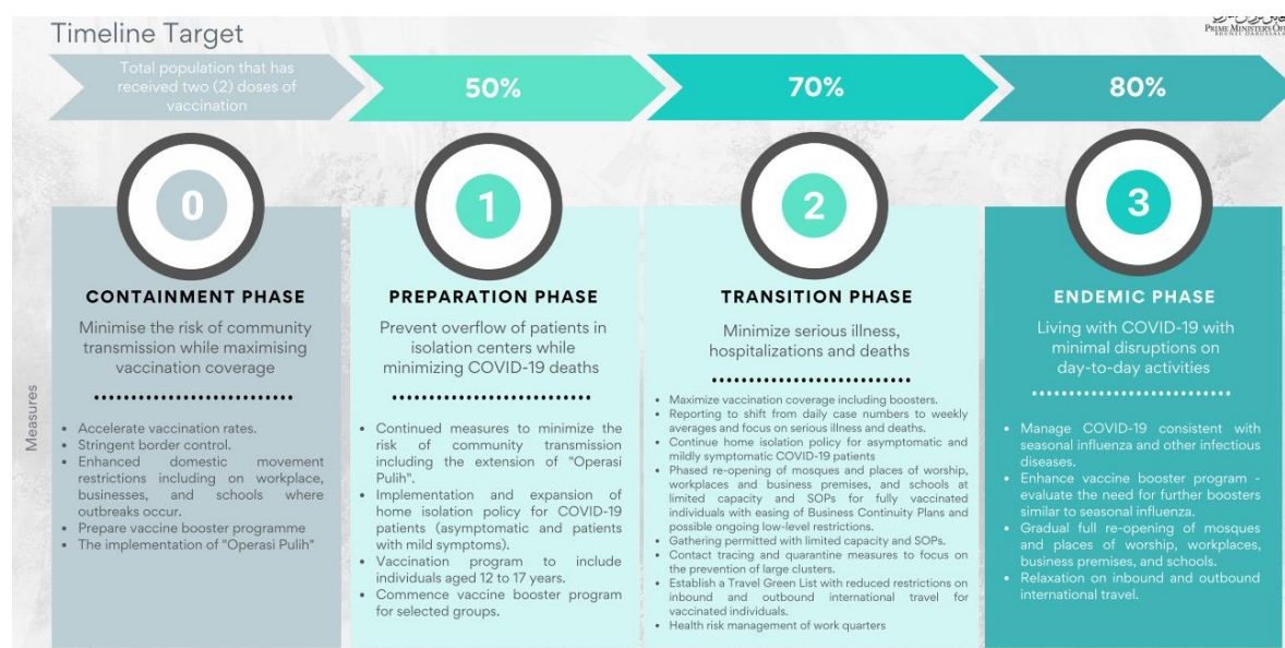
Figure 1. Illustration of National COVID-19 Recovery Framework in Brunei [41].

only workers in the essential fields were allowed to work in the office [38]. The number of cases decreased with the containment measures in place, and the curve flattened in November 2021. However, various challenges associated with economy lose, ineffective e-learning, psychological and emotional stress have been raised due to stricter control measures during the second wave [45, 46]. Thereby, a National COVID-19 Recovery Plan Framework was announced on 25th October 2021 to ensure a safe transition and stable situation with minimal disruption to the daily activities of the community [41] (Figure 1). Despite the containment phase, this framework also includes the preparation phase, transition phase and endemic phase, whereby the commencement of each stage was based on vaccination coverage status and critical cases. Government is ready to shift the zero-COVID strategy to COVID-19 protection, a new phase of safely living with this deadly virus [41].