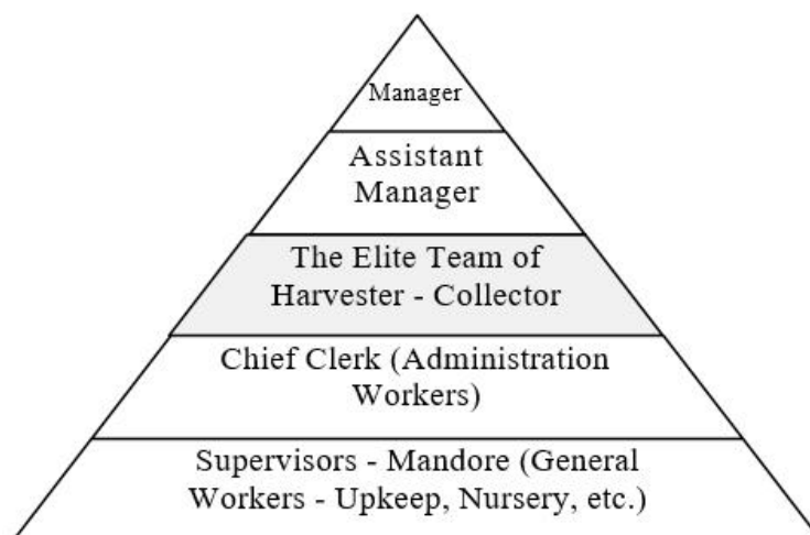
Figure 1. A suggestion where to place the elite team of harvester and collector in the plantation sector hierarchy.

This evidence and from our experiences in PLASMA that the training must be held in combination (30:70) of both theoretical (30%) and practical components (70%) make the author confident, TVET in the oil palm industry can produce a competent trainee.