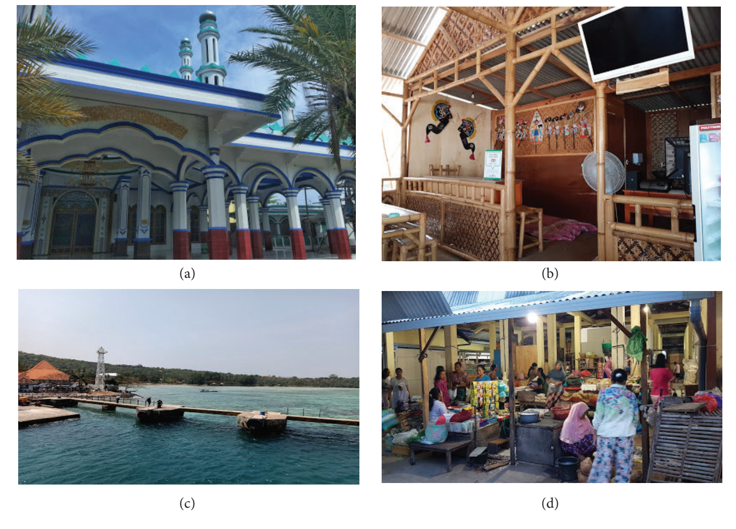
Figure 2. a) Saung Odang Karimunjawa, b) Masjid Agung Karimunjawa, c) Pasar Karimunjawa, d) Harbor Karimunjawa