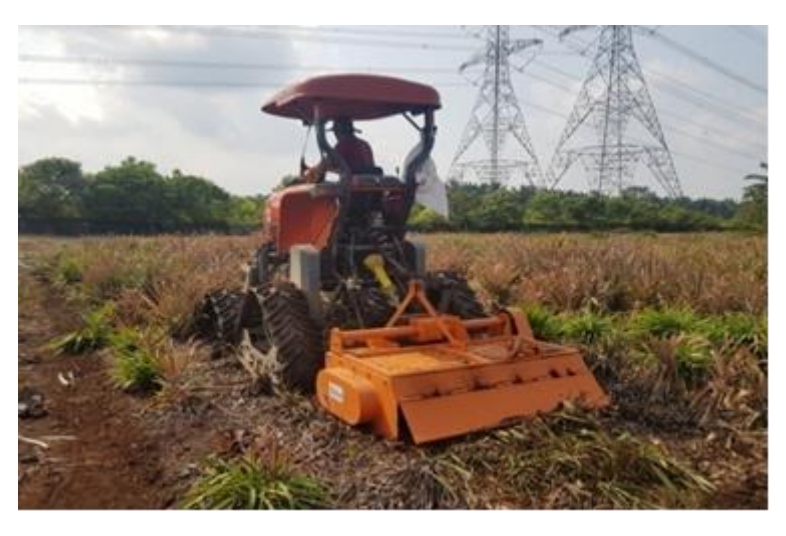
Figure 7. Test and evaluation of the prototype.

The machine prototype was tested and evaluated for the functionality mounted by Kubota 38 hp high clearance tractor at pineapple testing plot station MARDI Pontian, Johor shown in Figure 7. Using 2 different speed rate of 1.1 km/hr and 1.3 km/hr with 3nd gears low and high and the speed of the PTO is 540 rpm driven for same gear. Fixed 2000 rpm tractor speed in the same gear, distance of 12 \text{ m} \times 16 \text{ m} with 8 replicates and total area of 0.0192 hectares show in Figure 8 and time had been taken and recorded for analysis.The main aim is to ensure that plant residues are produced as fine material using 2 different gears but the same PTO speed.