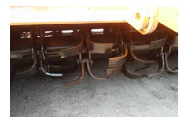
Figure 5. Composition of blades at the drum in actual view.