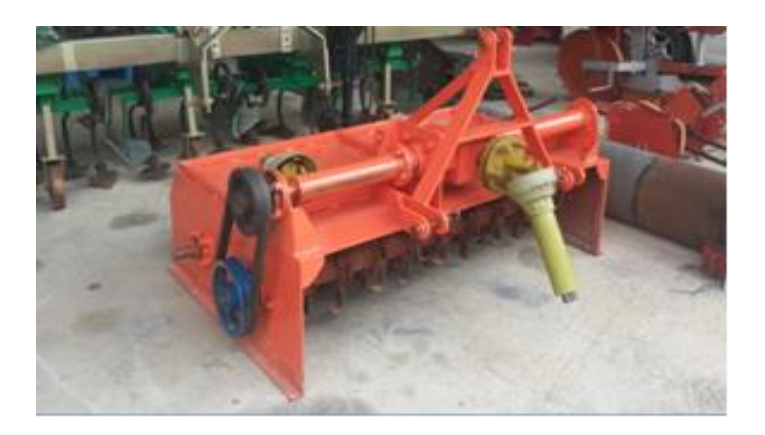
Figure 6. Prototype double rotor shredding machine.