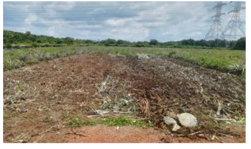
Figure 9. Fine and fibrous material pineapple residues pineapple residues management.