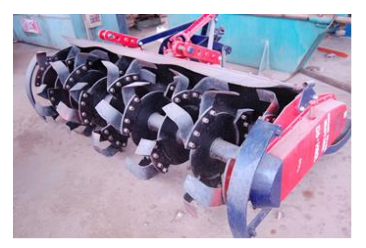
Figure 1. Existing machine pineapple mulched.