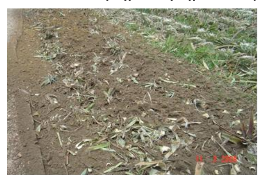
Figure 10. Chopped into small pieces but only separated into a few large parts.

Figure 9. Fine and fibrous material pineapple residues pineapple residues management.