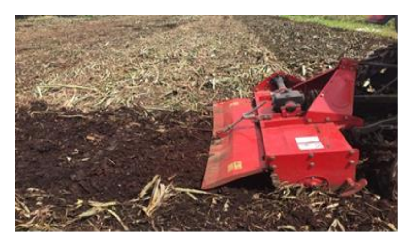
Figure 9. The pineapple residue rotting after 1 week and it been shred once more time before replanted.

this prototype can be done before the replanting show in Figure 9. As conclusion, by using this machine, it will reduce negative impact of environment and also prevent the use of chemical and open burns. This machine has a great potential to solve pineapple residue and is widely implemented. It has been designed and fabricated locally, making it easier to adapt to Malaysia's environment and conditions.